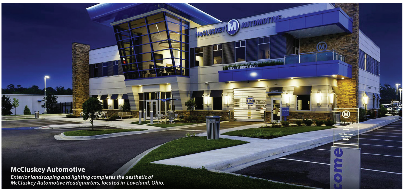
McCluskey Automotive Exterior landscaping and lighting completes the aesthetic of McCluskey Automotive Headquarters, located in Loveland, Ohio.