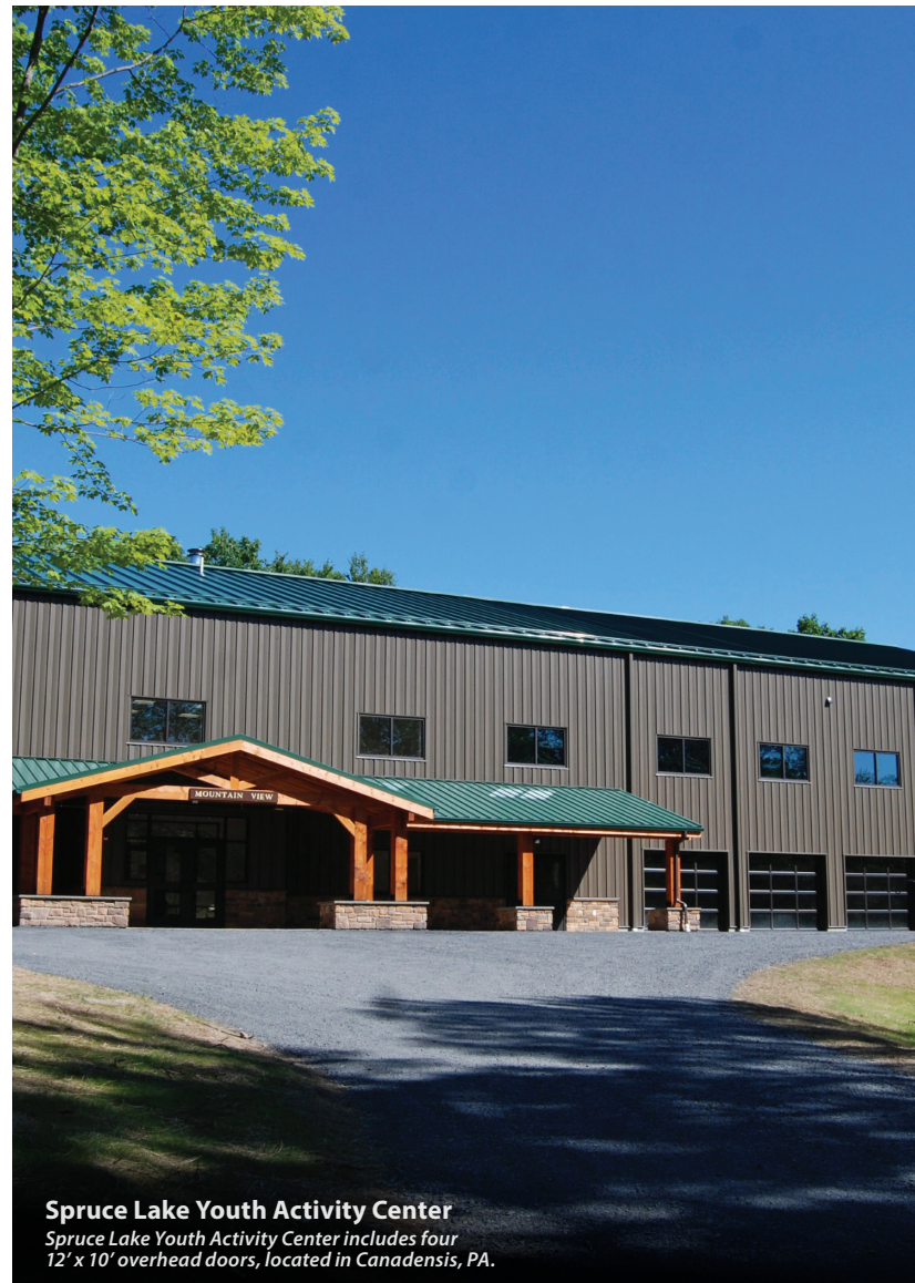
Spruce Lake Youth Activity Center Spruce Lake Youth Activity Center includes four 12' x 10' overhead doors, located in Canadensis, PA.